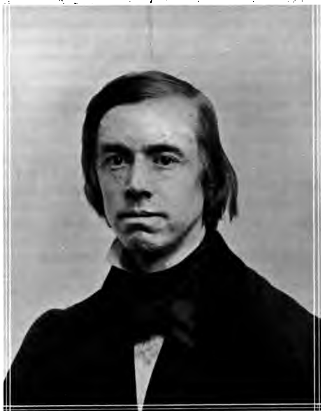
THOMAS STARR KING. SAN FRANCISCO, 1860-1864